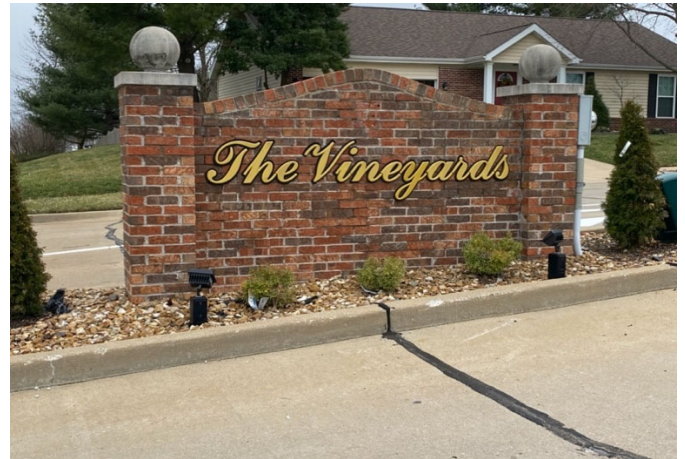
Beautiful Landscaping in the Vineyards (Seven Hills)